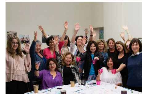
CHARIDY 2017 THAT'S A WRAP

The survey also found that NCJWA (Vic) members and supporters are a homogenous group, with over 80% born in Australia or other English speaking country i.e. UK, NZ, South Africa or USA. The largest group of members and supporters are in the 51-70 year age bracket and live in and around Caulfield. Over half the respondents also indicated that they are traditional Jews. Younger women are underrepresented in our membership cohort despite becoming involved as volunteers, members of committees and attending Next Gen events. This highlights the need for us to market membership of our organisation to both the younger age group and to those who live beyond