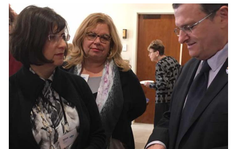
MEETING WITH THE ISRAELI AMBASSADOR, CANBERRA