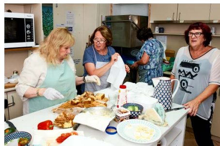
IN THE KITCHEN