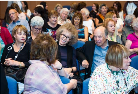
2017 FANNY READING LECTURE AUDIENCE