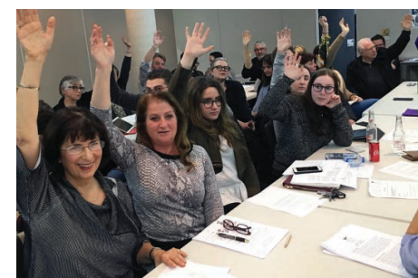
JCCV PLENUM MARRIAGE EQUALITY VOTE