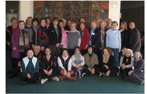
2017 NCJWA PLENUM, CANBERRA