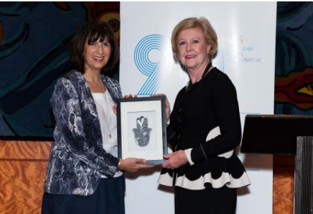
2017 FANNY READING HUMAN RIGHTS LECTURE EMERITUS PROF GILLIAN TRIGGS, MIRIAM BASS