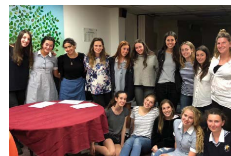
JAM GIRLS 2017